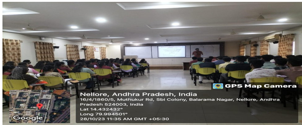
The Resource Person Explaining the Concepts

In the future, we are sure that power electronics applications towards Power Quality will proliferate everywhere. This is because the cost of power electronics is decreasing along with the reduction of size and improvement of performance, and energy cost is increasing almost every day